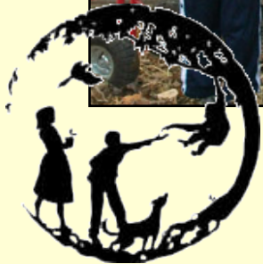
Roots & Shoots