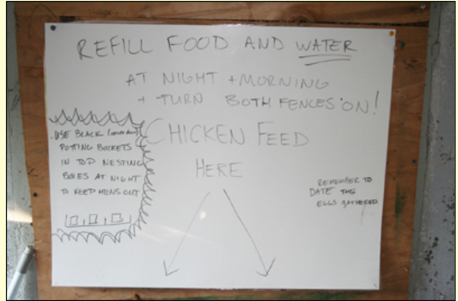
Zenger Farm in Portland, Oregon